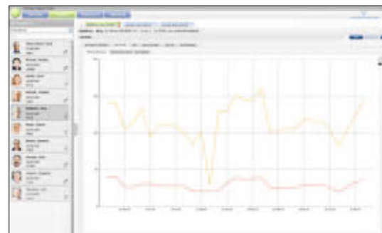
Therapy Support Suite – Laboratory value history