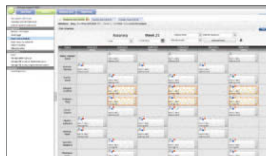
Therapy Support Suite – Clinic Scheduler